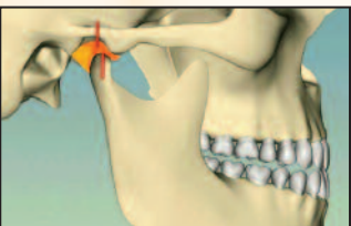
Fig. 8 This animation helped explain the importance of anterior guidance to the patient and why his lack of guidance contributed to the wearing of his teeth.