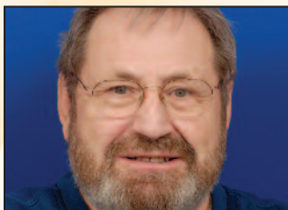
Fig. 4 Patient Two with severely worn upper and lower anteriors.