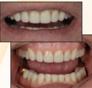
Fig. 9 Patient Three following comprehensive treatment that BiteFX helped the patient to understand his occlusal disease.