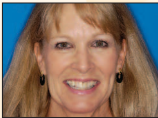
Fig. 1 Patient One with chipped bonding, abfractions.

Developed by Dynamic Thought® and Don Reid DDS, the BiteFX™ animation software provides the dental professional with a simple to use, easy to present graphic tool for presentation of malocclusion concepts to the dental patient. BiteFX is compatible with Windows operating systems.*