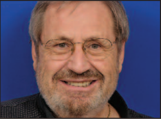
Fig. 6 Patient Two after equilibration, placed four anterior crowns with composite bonding of cuspids.