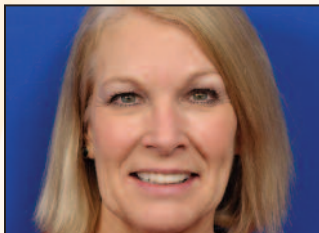
Fig. 3 Four years after initial treatment, Patient One is stable, comfortable following resin composite bonding.