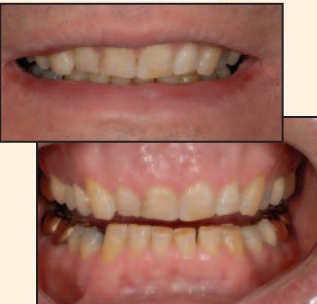
Fig. 7 Patient Three showing extensive tooth wear resulting in unhappiness with smile.