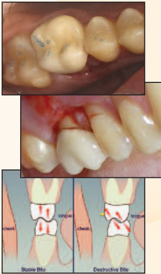
Tooth #3 showing anatomically designed crown resulting in facial bone loss due to poor equilibration and inappropriate placement of crown in the existing occlusal plane. The BiteFX animation is instrumental in helping the patient understand this complicated cause and effect.