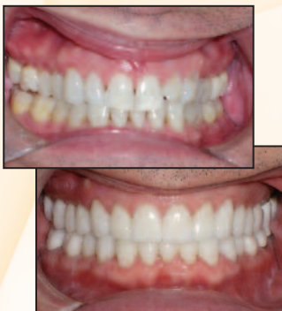
Patient photos showing pre-treatment and long term success of full mouth restoration produced by correct occlusal analysis and treatment planning.