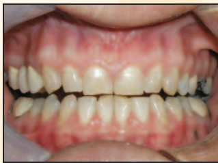
Patient who was fitted with a full dental bridge that was anatomically correct but occlusally incorrect causing neuromuscular and tooth pain. Photo shows obvious occlusal disease that was not addressed.

Developed by Dynamic Thought® and Don Reid DDS, the BiteFX™ animation software provides the dental professional with a simple to use, easy to present graphic tool for presentation of malocclusion concepts to the dental patient. BiteFX is compatible with Windows operating systems.*