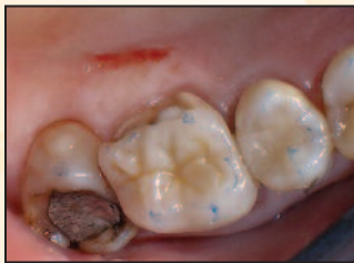
Ceramic crown failure due to poor preparation and lack of required equilibration.