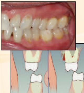
Patient photo showing occlusal wear and multiple abfractions. BiteFX animations clearly demonstrate cause due to lack of canine guidance resulting in severe occlusal disease.